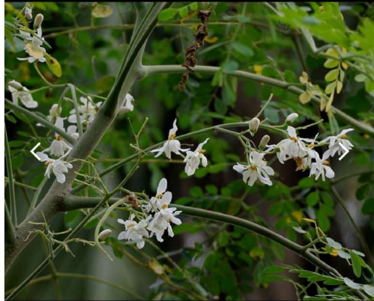
J.M.Garg • CC BY-SA 3.0